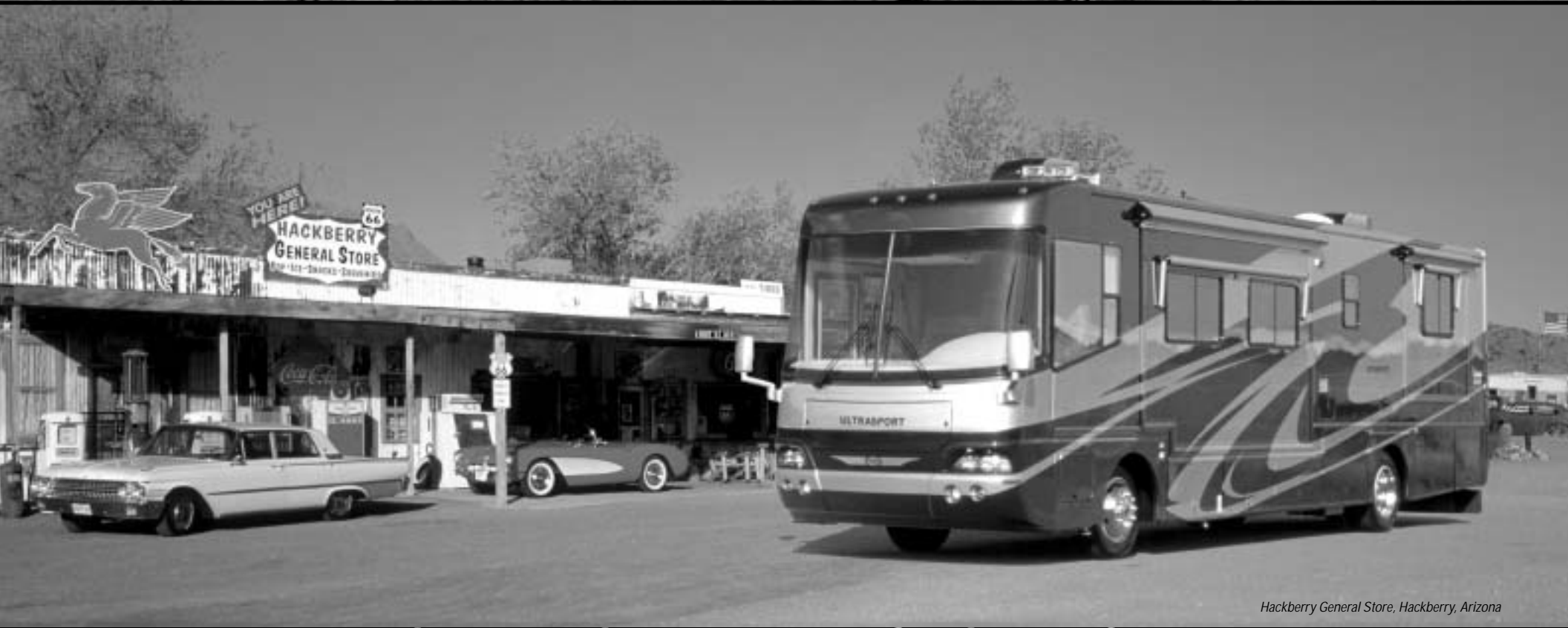
Hackberry General Store, Hackberry, Arizona

ILLINOIS MISSOURI KANSAS OKLAHOMA TEXAS NEW MEXICO ARIZONA CALIFORNIA